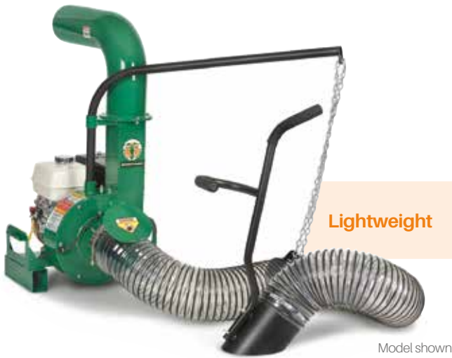
Model shown: DL1301HEU