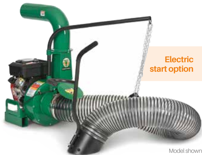
Model shown: DL1801VE with electric start

The 20 cm intake hose is a 300 cm long, best in class, clear poly helical coil.