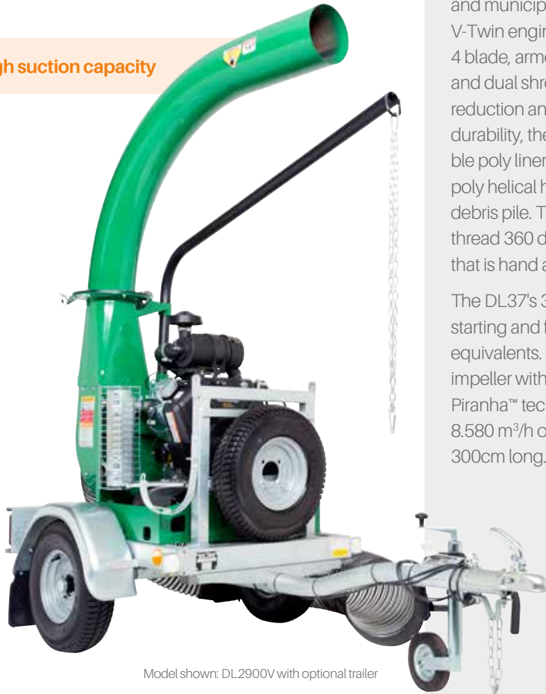
Model shown: DL2900V with optional trailer