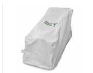
Cover Waterproof. (891137)