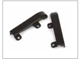
Nozzle Wear Kit Prevents nozzle wear on hard surface applications. (891127)