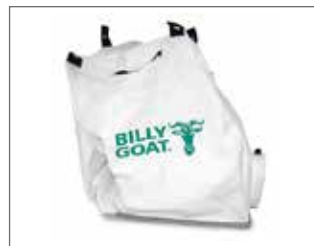
Foldable Turf Bag For better dust control. 151 litre capacity. (891126)