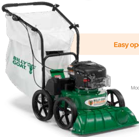
Model shown: KV601SP