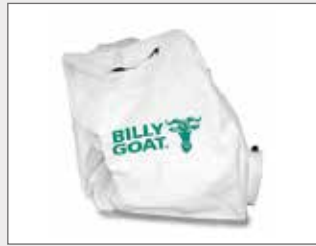
LB Turf Bag Turf bag for Little Billy. 105 litre capacity. (900722)