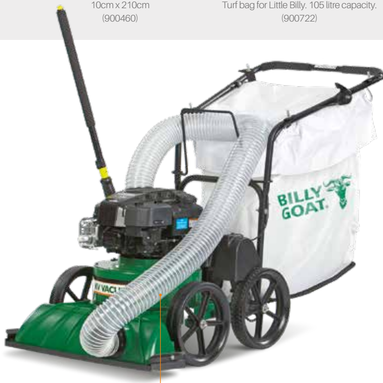
KV601SP with Hose Kit The optional hose kit helps between shrubs, beds and under decks or utilities. With telescopic handle (891125)