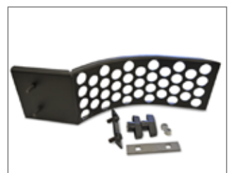
Shredder Screen Kit Reduces dry leaves up to 12:1. (891153)