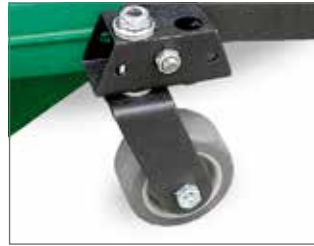
Caster Wheel Kit Increases manoeuvrability. (891128)