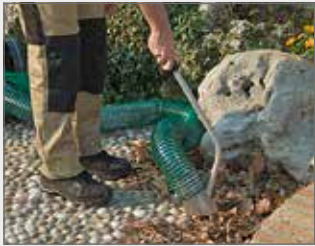
LB Hose Kit 10cm x 210cm (900460)